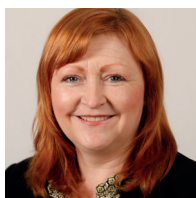
Emma Harper Scottish National Party