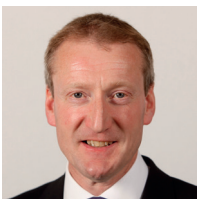
Tavish Scott Scottish Liberal Democrats