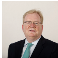
Jackson Carlaw Scottish Conservative and Unionist Party