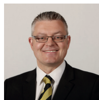
Stuart McMillan Scottish National Party