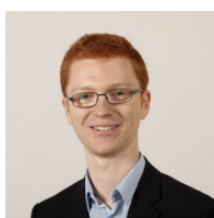
Ross Greer Scottish Green Party