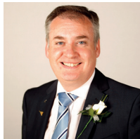
Richard Lochhead Scottish National Party