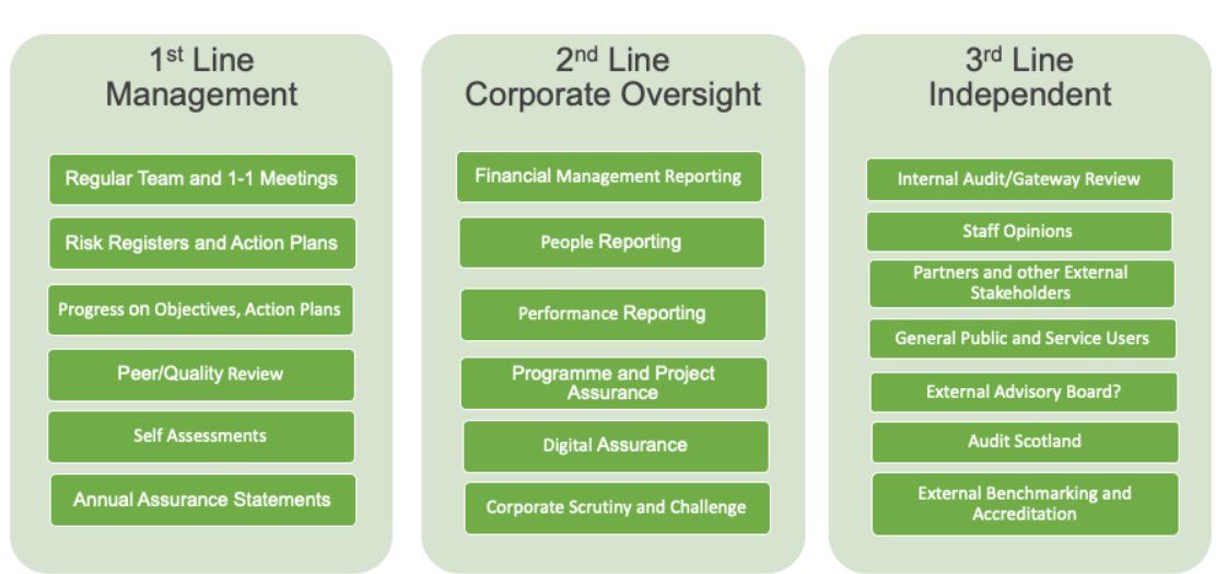
Figure 3: Three lines of assurance model

2. Sarah and the DG Communities team have developed an approach based on the 'Three lines of assurance' model that will already be familiar to DGs – and which is summarised for reference in Figure 3 below.