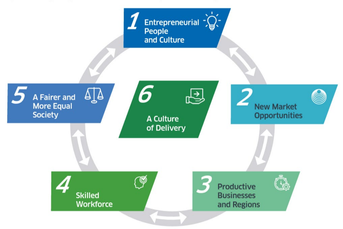
Figure 3: Policy Programmes of Action Form a Cycle with Delivery at the Centre

Under each policy programme, the strategy lists programmes for action. These include actions that could apply to agencies in the Culture and Heritage sector. For example, under the fifth programme is listed the following action—