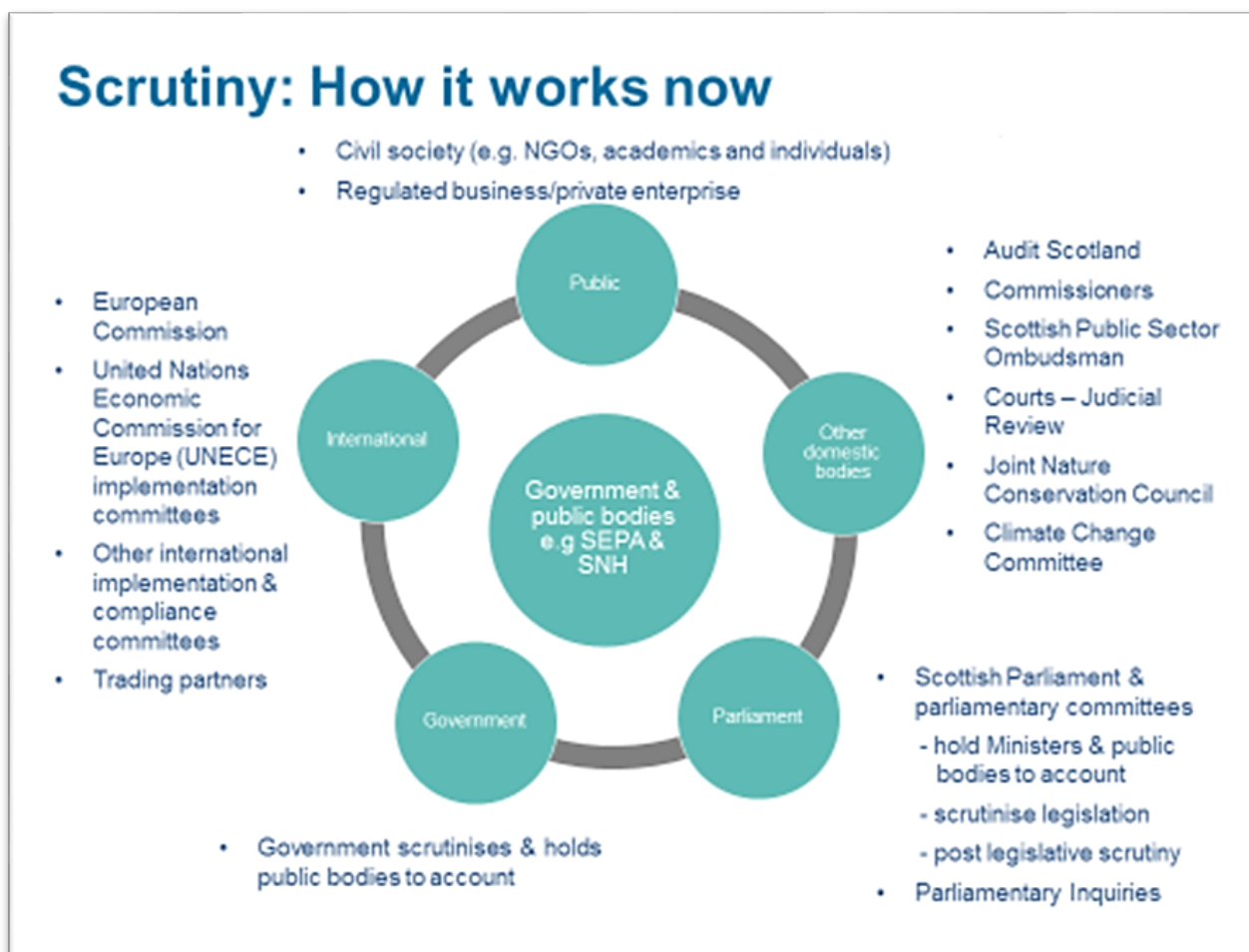
diagram showing the organisations involved in environmental scrutiny (and other functions) in Scotland 18 :