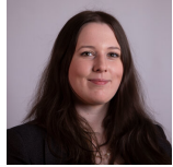
Emma Roddick Scottish National Party