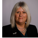
Sue Webber Scottish Conservative and Unionist Party