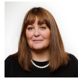
Deputy Convener Ruth Maguire Scottish National Party