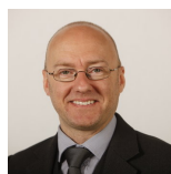
Deputy Convener Patrick Harvie Scottish Green Party