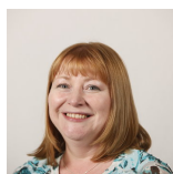
Convener Clare Adamson Scottish National Party