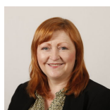
Emma Harper Scottish National Party