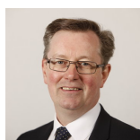
Alexander Stewart Scottish Conservative and Unionist Party