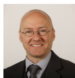
Deputy Convener Patrick Harvie Scottish Green Party