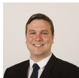
Tom Arthur Scottish National Party