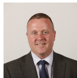
Deputy Convener Bob Doris Scottish National Party