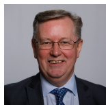
Alexander Stewart Scottish Conservative and Unionist Party