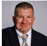
Jeremy Balfour Scottish Conservative and Unionist Party