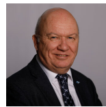
Gordon MacDonald Scottish National Party