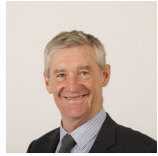
Peter Chapman Scottish Conservative and Unionist Party