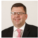
Colin Smyth Scottish Labour