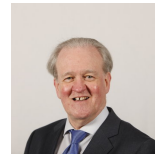
Stewart Stevenson Scottish National Party