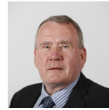
Richard Lyle Scottish National Party