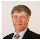
Convener Edward Mountain Scottish Conservative and Unionist Party