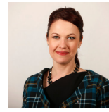
Deputy Convener Gail Ross Scottish National Party