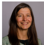
Ariane Burgess Scottish Green Party