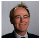
Alasdair Allan Scottish National Party