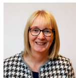
Deputy Convener Beatrice Wishart Scottish Liberal Democrats