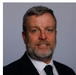
Convener Finlay Carson Scottish Conservative and Unionist Party