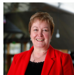
Rhoda Grant Scottish Labour