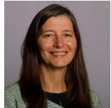
Ariane Burgess Scottish Green Party