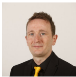
Fulton MacGregor Scottish National Party