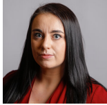
Meghan Gallacher Scottish Conservative and Unionist Party