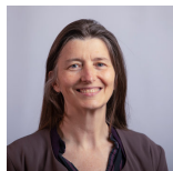
Convener Ariane Burgess Scottish Green Party