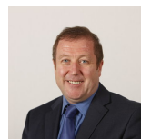
Graeme Dey Scottish National Party