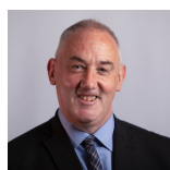
Paul McLennan Scottish National Party