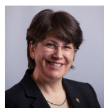
Tess White Scottish Conservative and Unionist Party