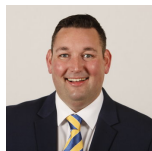
Miles Briggs Scottish Conservative and Unionist Party