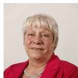
Sandra White Scottish National Party