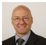
Patrick Harvie Scottish Green Party