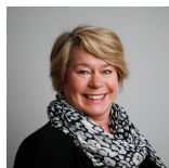
Michelle Thomson Scottish National Party