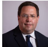
Craig Hoy Scottish Conservative and Unionist Party