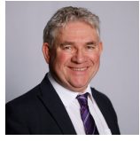
Convener Kenneth Gibson Scottish National Party