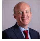
Deputy Convener Michael Marra Scottish Labour