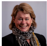
Michelle Thomson Scottish National Party