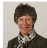
Liz Smith Scottish Conservative and Unionist Party