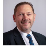
Douglas Lumsden Scottish Conservative and Unionist Party