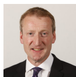
Tavish Scott Scottish Liberal Democrats