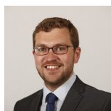
Oliver Mundell Scottish Conservative and Unionist Party