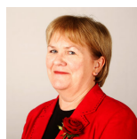
Deputy Convener Johann Lamont Scottish Labour