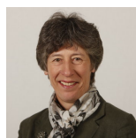
Liz Smith Scottish Conservative and Unionist Party