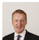
Tavish Scott Scottish Liberal Democrats