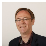
Alasdair Allan Scottish National Party