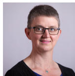
Deputy Convener Maggie Chapman Scottish Green Party