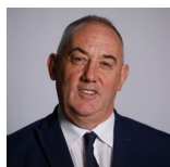
Paul McLennan Scottish National Party