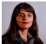
Pam Gosal Scottish Conservative and Unionist Party