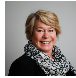
Deputy Convener Michelle Thomson Scottish National Party