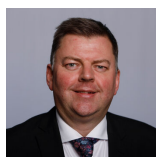
Convener Colin Smyth Scottish Labour