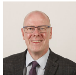
Kevin Stewart Scottish National Party