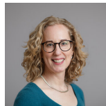
Lorna Slater Scottish Green Party