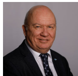
Gordon MacDonald Scottish National Party