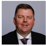
Convener Colin Smyth Scottish Labour