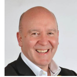
Willie Coffey Scottish National Party