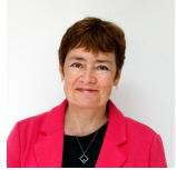
Sarah Boyack Scottish Labour