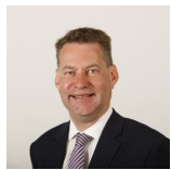
Murdo Fraser Scottish Conservative and Unionist Party