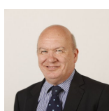
Gordon MacDonald Scottish National Party