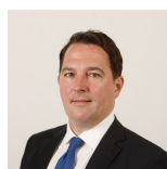
Dean Lockhart Scottish Conservative and Unionist Party