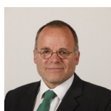
Andy Wightman Scottish Green Party