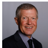
Willie Rennie Scottish Liberal Democrats