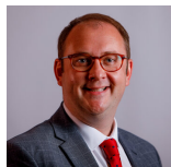
Paul O'Kane Scottish Labour