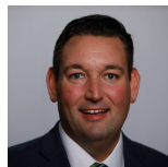
Miles Briggs Scottish Conservative and Unionist Party