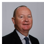
Bill Kidd Scottish National Party