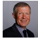
Willie Rennie Scottish Liberal Democrats