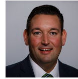
Miles Briggs Scottish Conservative and Unionist Party