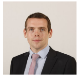
Convener Douglas Ross Scottish Conservative and Unionist Party