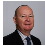
Bill Kidd Scottish National Party