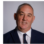
Paul McLennan Scottish National Party