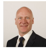
Joe FitzPatrick Scottish National Party