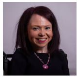
Pam Duncan-Glancy Scottish Labour