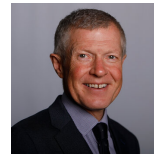
Willie Rennie Scottish Liberal Democrats