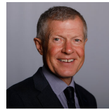
Willie Rennie Scottish Liberal Democrats