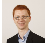
Ross Greer Scottish Green Party