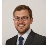
Oliver Mundell Scottish Conservative and Unionist Party