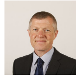
Willie Rennie Scottish Liberal Democrats