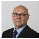
James Dornan Scottish National Party