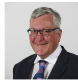
Fergus Ewing Scottish National Party