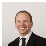
Donald Cameron Scottish Conservative and Unionist Party