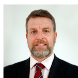
Finlay Carson Scottish Conservative and Unionist Party