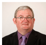
Angus MacDonald Scottish National Party