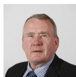
Richard Lyle Scottish National Party