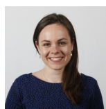
Kate Forbes Scottish National Party