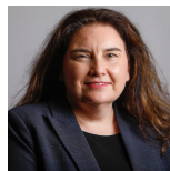
Katy Clark Scottish Labour