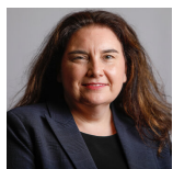
Katy Clark Scottish Labour