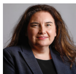
Katy Clark Scottish Labour