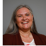
Roz McCall Scottish Conservative and Unionist Party