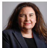
Katy Clark Scottish Labour