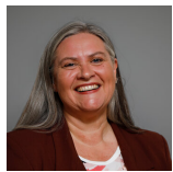
Roz McCall Scottish Conservative and Unionist Party