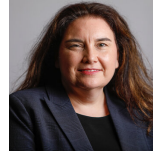
Katy Clark Scottish Labour