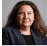
Katy Clark Scottish Labour