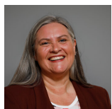
Roz McCall Scottish Conservative and Unionist Party