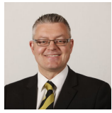
Convener Stuart McMillan Scottish National Party