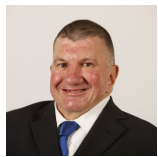
Jeremy Balfour Scottish Conservative and Unionist Party