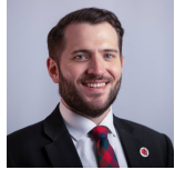
Paul Sweeney Scottish Labour