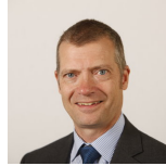
Graham Simpson Scottish Conservative and Unionist Party