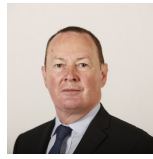
Deputy Convener Bill Kidd Scottish National Party